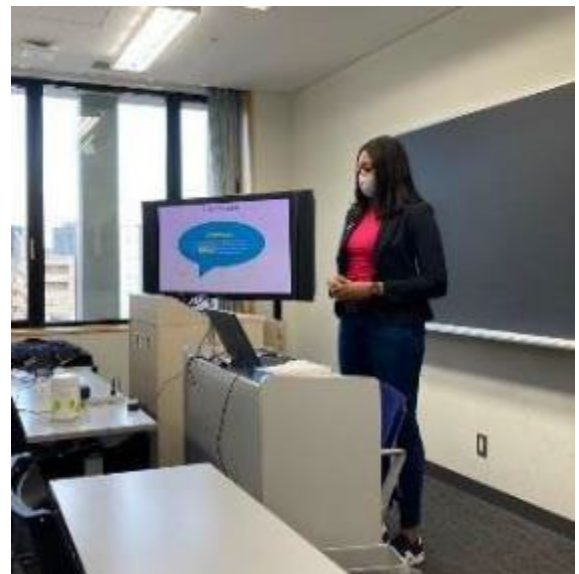
(AGU scholars presenting their Customs reform plans)