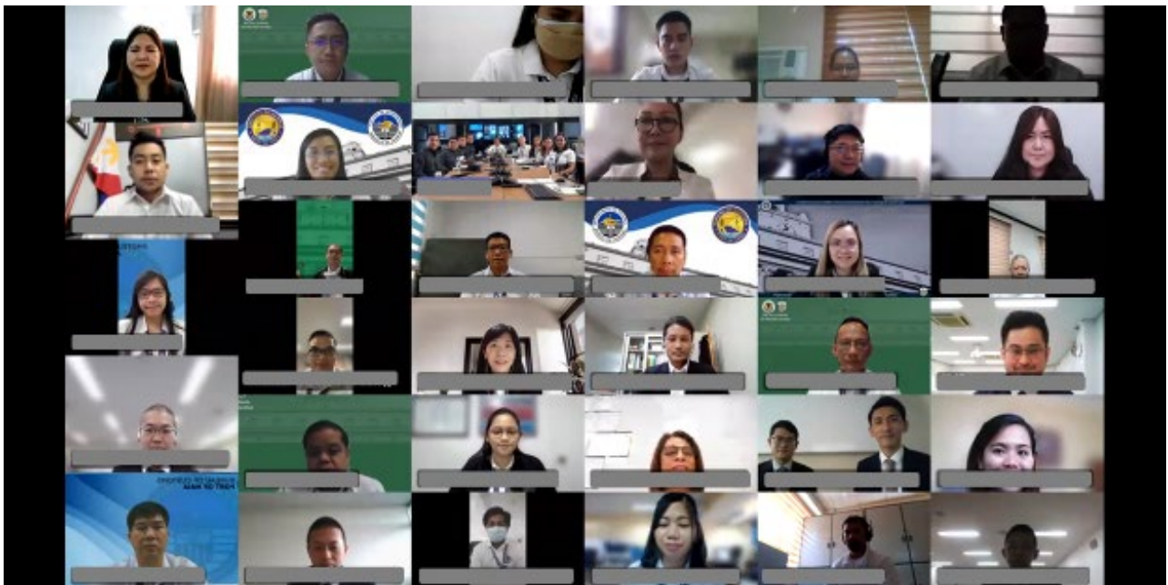
(Workshop for the Philippines Customs held in March)