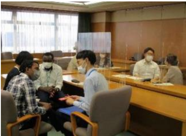
(Discussion between Scholars and Tokyo Customs officials)

The field trip also provided the opportunity for the Scholars and Tokyo Customs officers to exchange their view and opinions. It was the first time for Scholars to get together with Customs officials at regional Customs. The discussion was held in a warm atmosphere, and it became a fruitful opportunity for all participants.