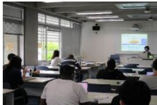
(One of the scenes in classroom)