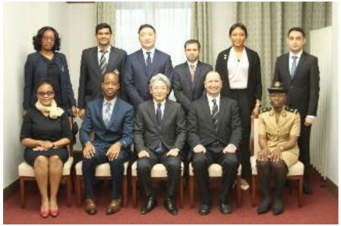
(AGU Scholars paying a courtesy call to DG of Japan Customs, 15 March 2022)