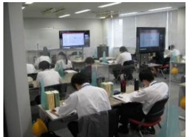
(Training in a hybrid format)