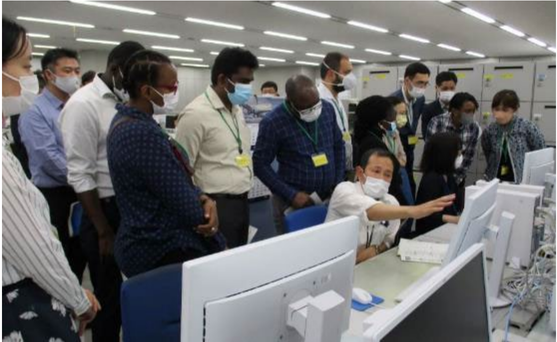
(Field trip to Tokyo Customs)

On 11 May, GRIPS Scholars visited Tokyo Customs Headquarters for their field trip. They were briefed on the overview of Tokyo Customs and the theory of HS classification from lectures of Tokyo Customs. Then the Scholars visited several sections and observed some daily operations of Tokyo Customs.