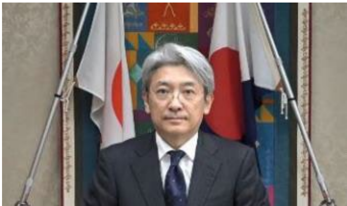
(Video message of the President of the CTI)