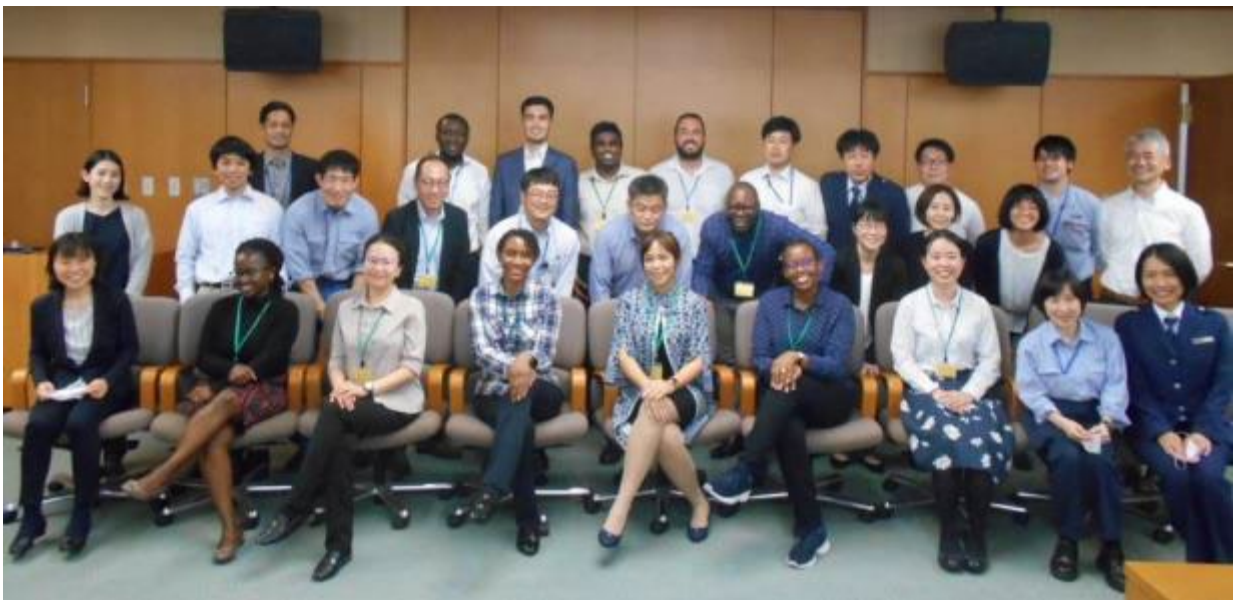
(GRIPS Scholars, 11 May 2022)